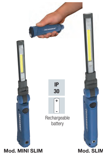
Mod. MINI SLIM