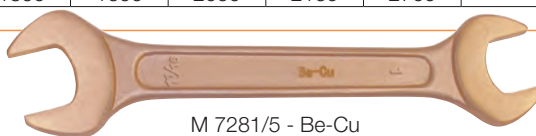
M 7281/5 - Be-Cu