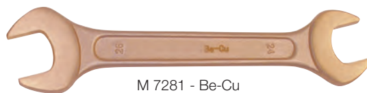
M 7281 - Be-Cu