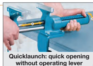
Quicklaunch: quick opening without operating lever