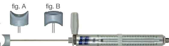
H 5396/9 + H 5396/8 sz. 2 + H 5396/4 sz. 20