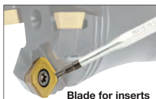
Blade for inserts