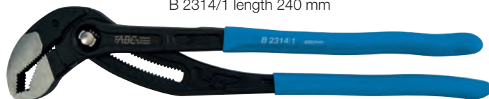
B 2314/1 length 400 mm

Automatic opening adjustment on the workpiece itself, push-button operated